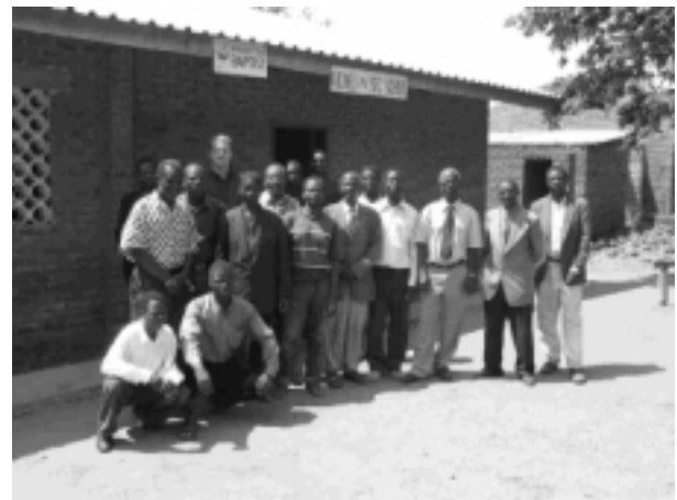
Ntcheu Bible School in Malawi