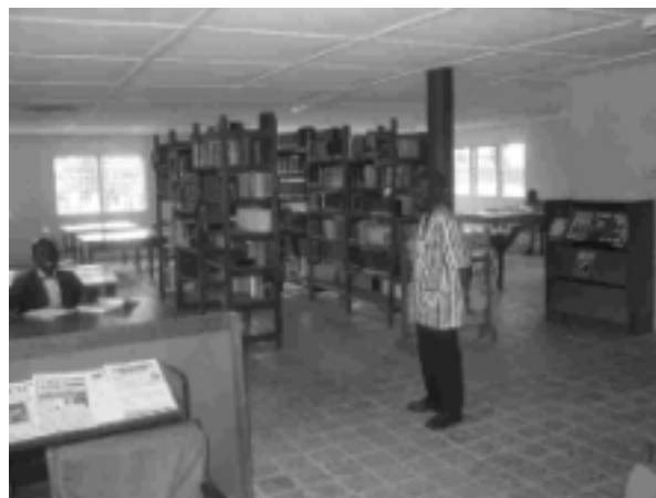
Library of the TECT in Jui (Sierra Leone)