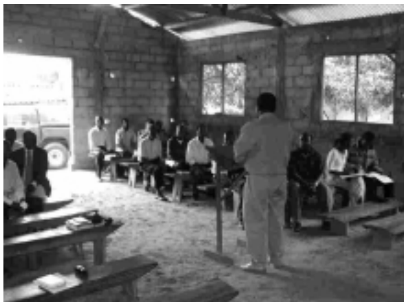
Leadership Training in Mozambique