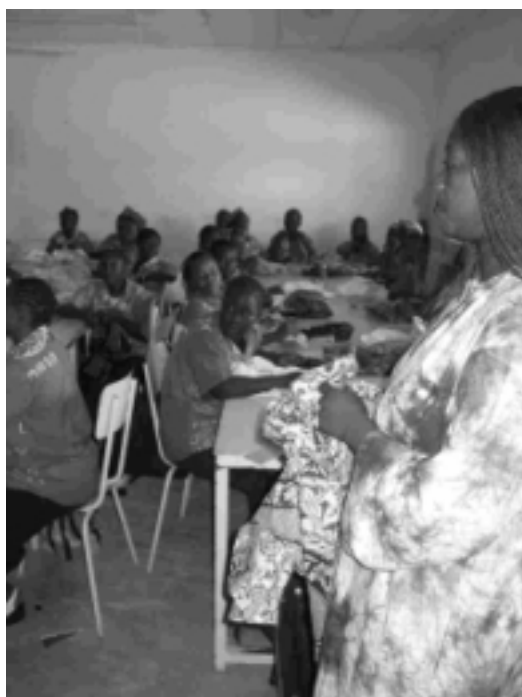
Tailoring Classes in Garoua (Cameroon)