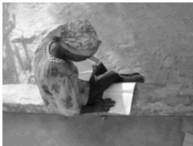
Girl student in Mokolo (Cameroon)