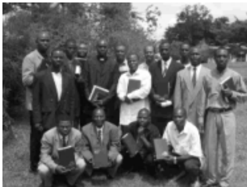
End of semester in Ndiki (Cameroon)