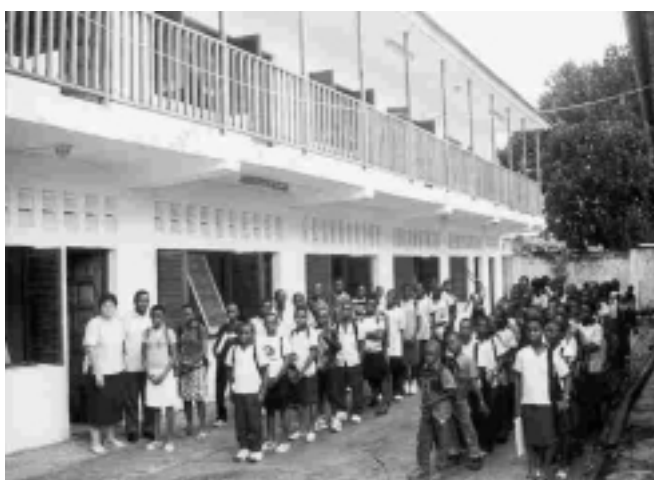
Primary school in Malabo (Equatorial Guinea)