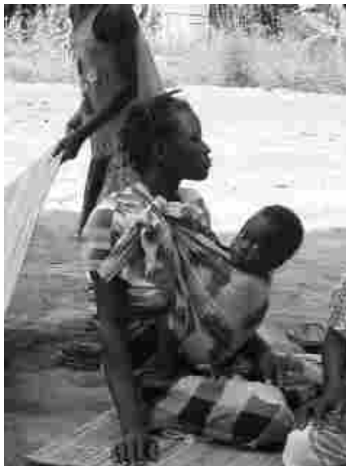
Mozambique: Training for Women

The Social Centre is still in the building-up stage. Priority had to be given to establishing the legal frame and the premises, i.e. the conditions promised and required before starting any courses. Both steps are time and energy consuming. The