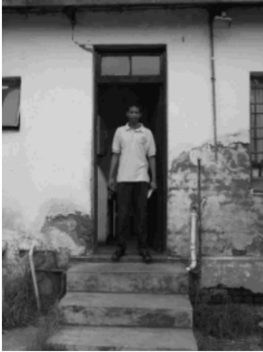
Student in front of the BCC in Soweto (South Africa)