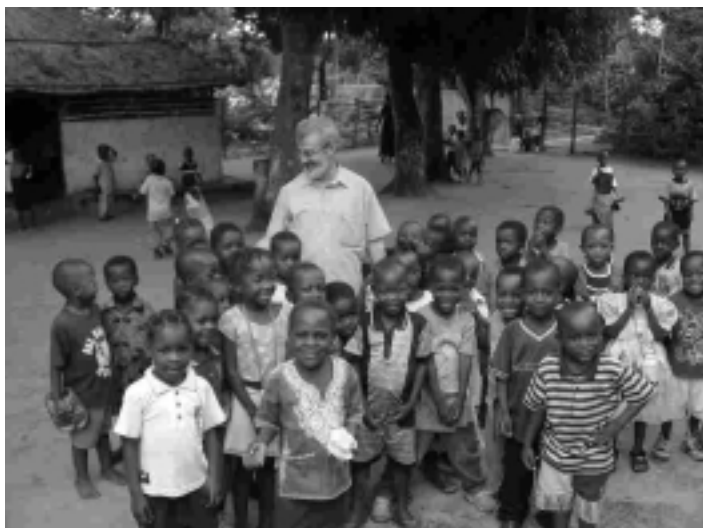
Primary School Pupils in Mozambique