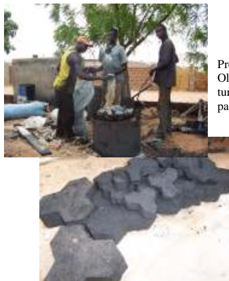
Pro plastique: Old plastic bags turned into paving stones”

In addition to the 16 teachers, there are administration staff in charge of finances and direction, and, from this year, a social worker has been hired to teach the students social behaviour.