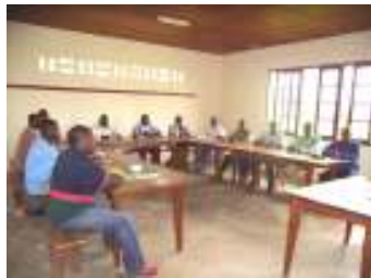
Well trained pastors may strengthen the churches' ministries.

Level I and Bachelor Preparatory class (started this year) and Bachelor Level I (also attending the seminary already last year). This is evidence that we have two study courses: pastoral training and a Bachelor degree course . Admission exams are held every year, for the academic year 2007/2008 on May 25 (written) and on May 26 (orals), for nearly 10 available places.