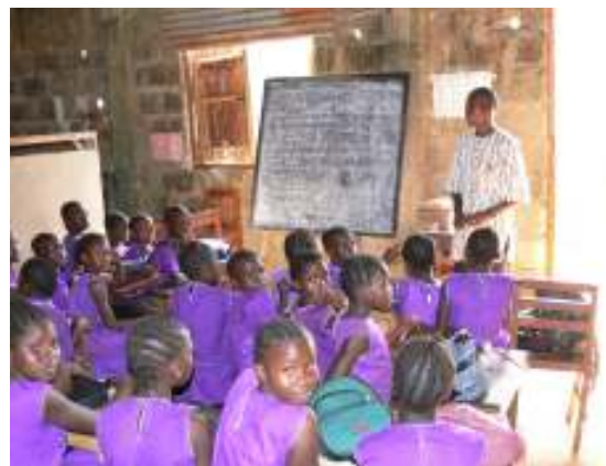
Schools in Sierra Leone: Needs of the schools increase as there is an ever increasing demand for admission.