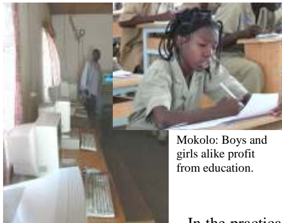
Mokolo: Boys and girls alike profit from education.

As before, the girls have been taught home economics. They have been introduced to all the areas: sewing, baby care, knitting, cooking, etc.