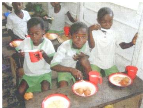
A good breakfast before startin lessons

The “Talita Cum” School has eight teachers: two teachers and a support teacher for the pre-school and five teachers for the primary school. The academic training of the teachers is not very good, as it is very difficult to find trained teachers in the interior of the country. For this reason, launching a continuation training programme for these teachers is very important.