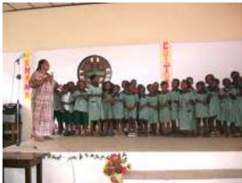
The Pre-school Choir in Malabo

The “El Buen Pastor” School, on the premises of the Baptist Church in Malabo, has a pre-school, a primary and a secondary school, all of which have a very good reputation. The Centre is undergoing important changes, as it has to implement the stipulations recently issued by the Ministry of Education. Among other things, these relate to the school entrance age, which has been lowered from 7 to 6 years. Therefore, there will be two classes of first graders in the coming year. For the second time, there is a 6 th form in primary school. The new secondary stream ESBA has been introduced, as four years of secondary school attendance are now compulsory. This year, we began with form 1; next year we will also have form 2.