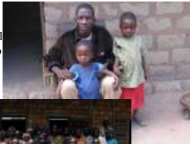
Bible School student, who has lost his wife