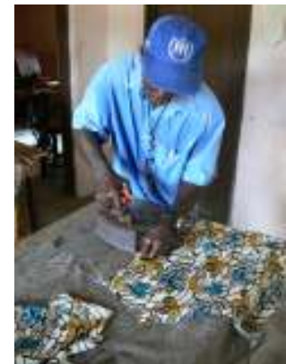
Makeni: Preparing for trades and further studies

The following training and grades are provided in Makama/Makeni: a two-year programme in agriculture (general) leading to a diploma , a three-year certificate programme in carpentry , a three-year certificate programme in masonry , a two-year certificate programme in tailoring , and a three-year certificate programme in secretarial and computer training . The syllabi are drawn up by the teachers and approved by the Ministry of Education.