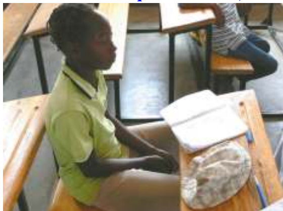
More pupils will be able to learn on the new school premises