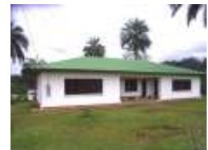
A nice building for classes

Our Seminary aims at training pastors for the UEBC Church and other churches, qualifying them successfully for their spiritual, academic and social ministries.