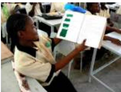
Clothes production and car mechanics - practical work is most important

The students learn to make electrical installations; in typewriting, they learn to write fast with good results. In the area of computer skills, the students learn to use a computer. After training in poultry, the students are expected to be able to run a poultry farm, and in agriculture, they are