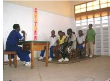
Theatre group of the pre-university class

This year, enrollment is 672 pupils. We teach in two shifts: In the morning, the first form of pre-school and primary school, and in the afternoon the second form of pre-school and secondary school. The age span of pupils thus is from 4 to 20. The pupils come from various socio-economic classes and from various regions: Fang, Bubi, Anobonese, Ndowé, Combe, Bisio.