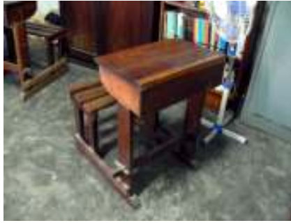
Qualified Education – and Lack of Room in Beira

Intensive Basic Course , which are taught mainly in five different regions of Mozambique: Macia, Tete, Beira, Quelimane and Nampula. This course is mainly geared to pastors in rural areas, evangelists and local church leaders who are unable to attend the daily classes at one of our three Bible Schools. The curriculum is more or less that of the Basic Course, at times with translation into the local language.