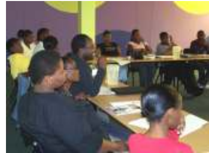
Workshop for project management

The qualifications we offer are a “Certificate in Ministry” (two years), the “Diploma Theology and Ministry” (three to four years), the “Bachelor of Theology Degree” (five to six years). On leaving the College, the students normally work as pastors in the churches of the Convention.